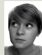
Image software is used to turn pic B&W then adjust brightness & contrast